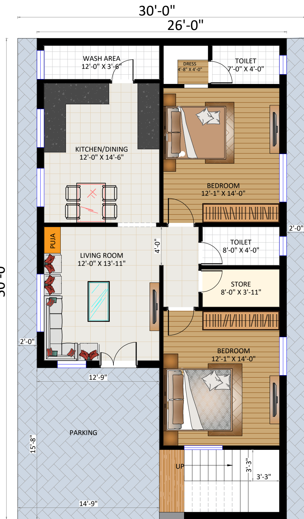
ROAD GROUND FLOOR PLAN FLOOR HT. 10'-11" NORTH FACING 29'X 50'